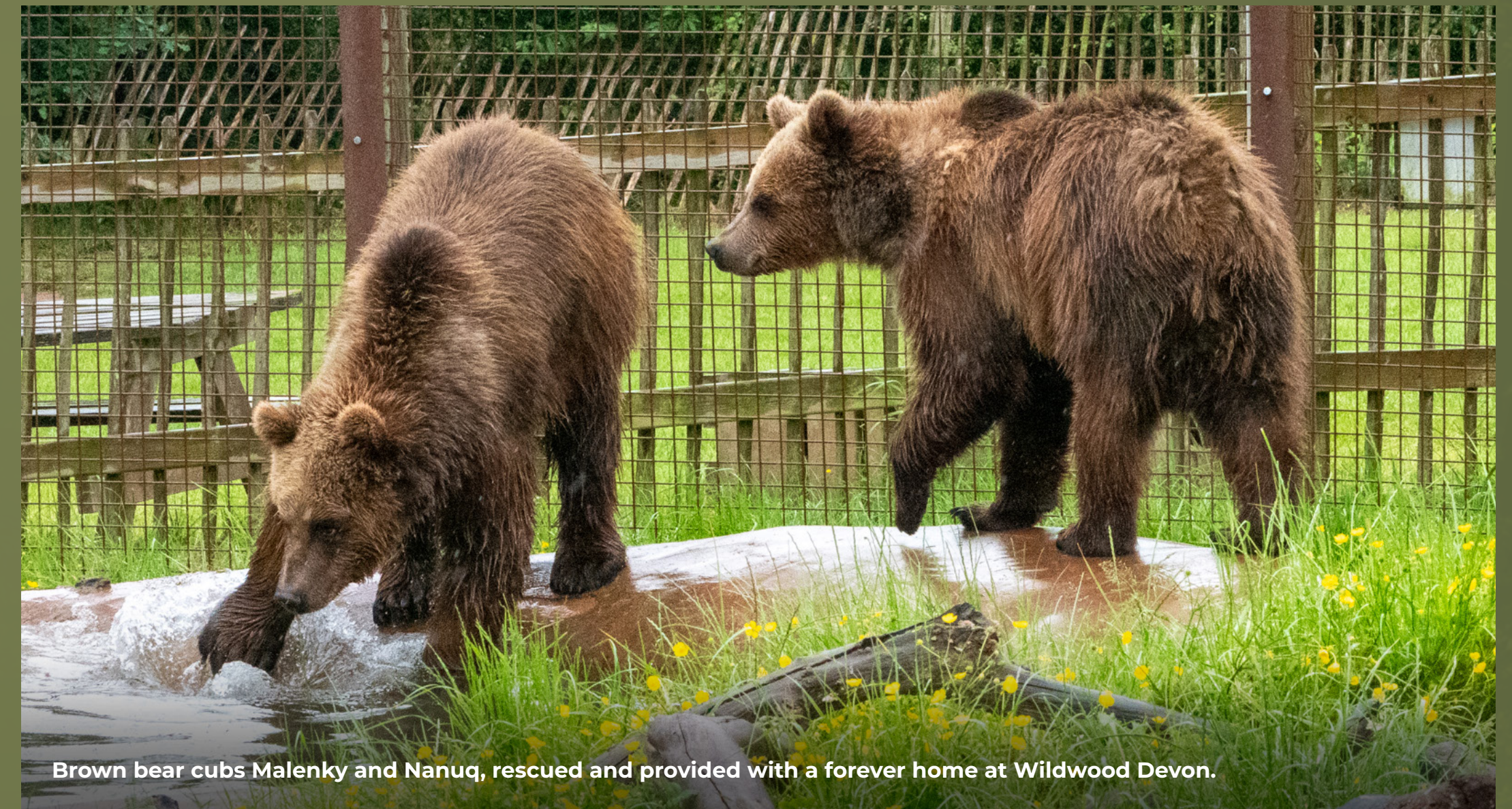
Brown bear cubs Malenky and Nanuq, rescued and provided with a forever home at Wildwood Devon.

Find out more 🌐 wildwoodtrust.org/brown-bear-rescue/