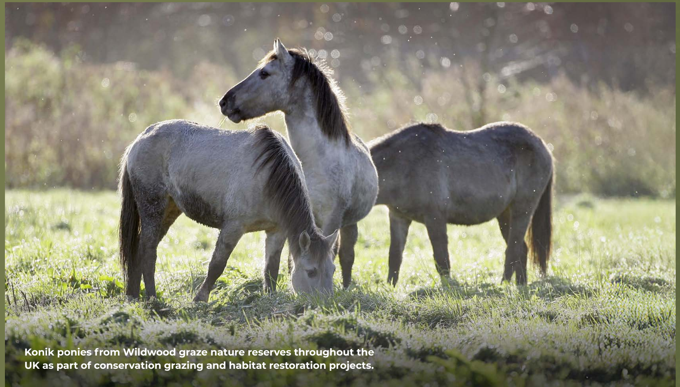
Konik ponies from Wildwood graze nature reserves throughout the UK as part of conservation grazing and habitat restoration projects.

Rewilding through the reintroduction of keystone species is one of our most powerful tools. Keystone species restore natural processes and habitats, transforming the landscape, and allowing countless other species to recover alongside them. Bringing these animals back restores large-scale ecosystems so they can become self-sustaining and resilient.